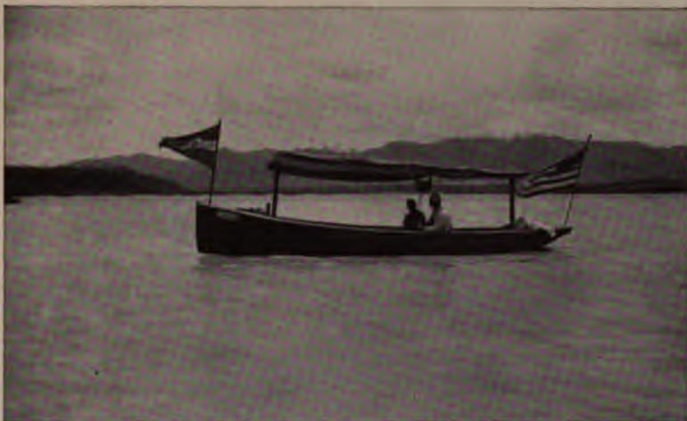
A Zone Police Launch